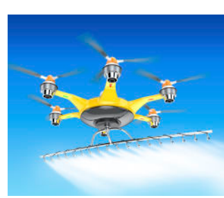
UAVs pose more of a safety risk to ag pilots than an economic threat.

pilots to cover hundreds of acres in a single load and treat thousands of acres per day. Consider an average sized field of 100 acres. A 500-gallon ag plane can treat the field in 20 minutes or less. How long would it take a UAV? Researchers at UC-Davis conducted field tests using a remotecontrolled helicopter in which it sprayed about five