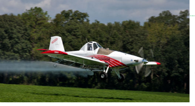
Aerial application is a vital component of high-yield agriculture, benefiting the environment by producing more crops on fewer acres.