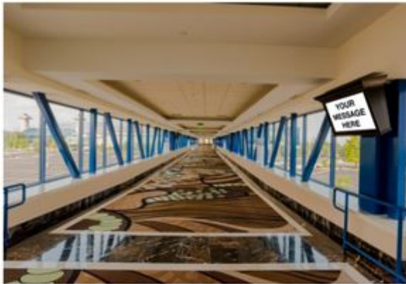
Example of a Sky Bridge TV

Sponsor's ad would run every 4th spot within rotation. Video or image length is up to :60 seconds. $2,500 (up to four sponsorships available)