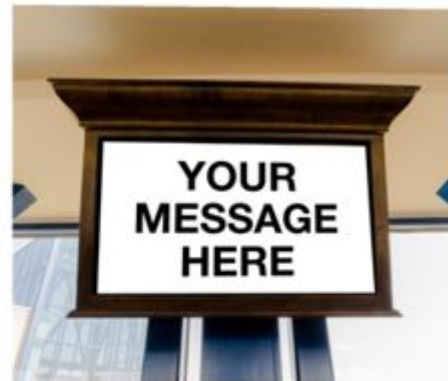
Close-up of a Sky Bridge TV (approx. 36.6" x 20.6"), 42" diagonally